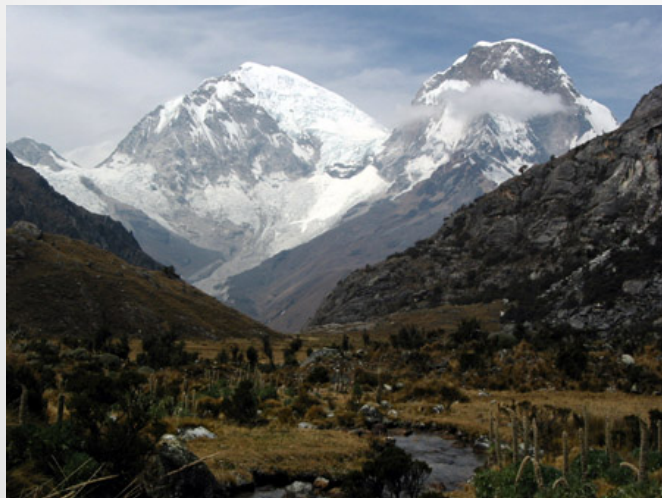
2 nd Highest Mountains in the World